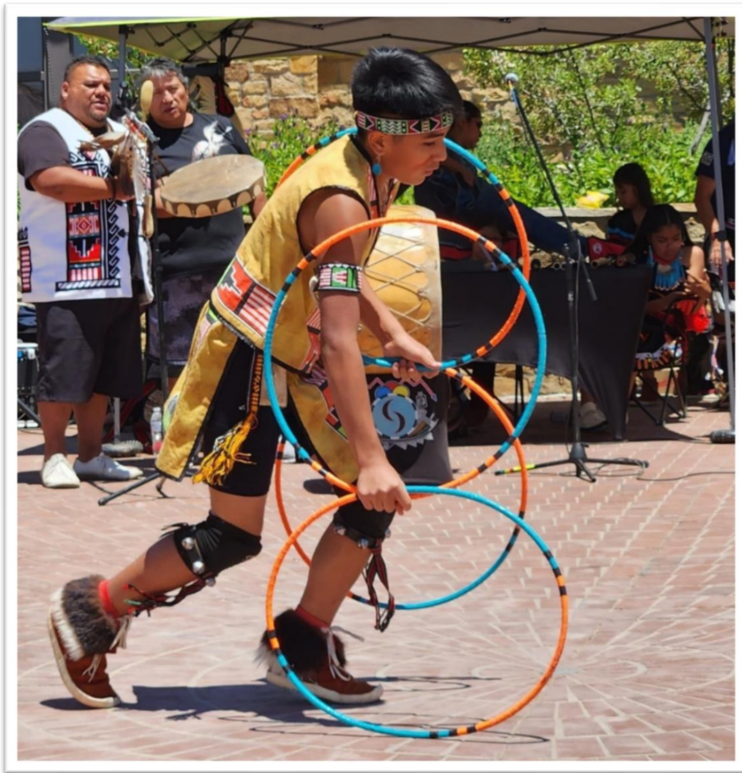
Maatuu Dancer, from Hopi Pueblo, at the Monument's first annual Indigenous Art Market.

CANM hosted its first Four Corners Indigenous Art Market at Canyons of the Ancients Visitor Center and Museum in partnership with SCCA. SCCA was able to hold the event on site as a fundraiser and process sales for the artists. BLM invited tribal members from the 26 Associated Tribes and Pueblos to host art booths, present cultural demonstrations, share cultural dances, and give lectures during which tribal members shared their truths and stories about the history of this landscape with the audience.