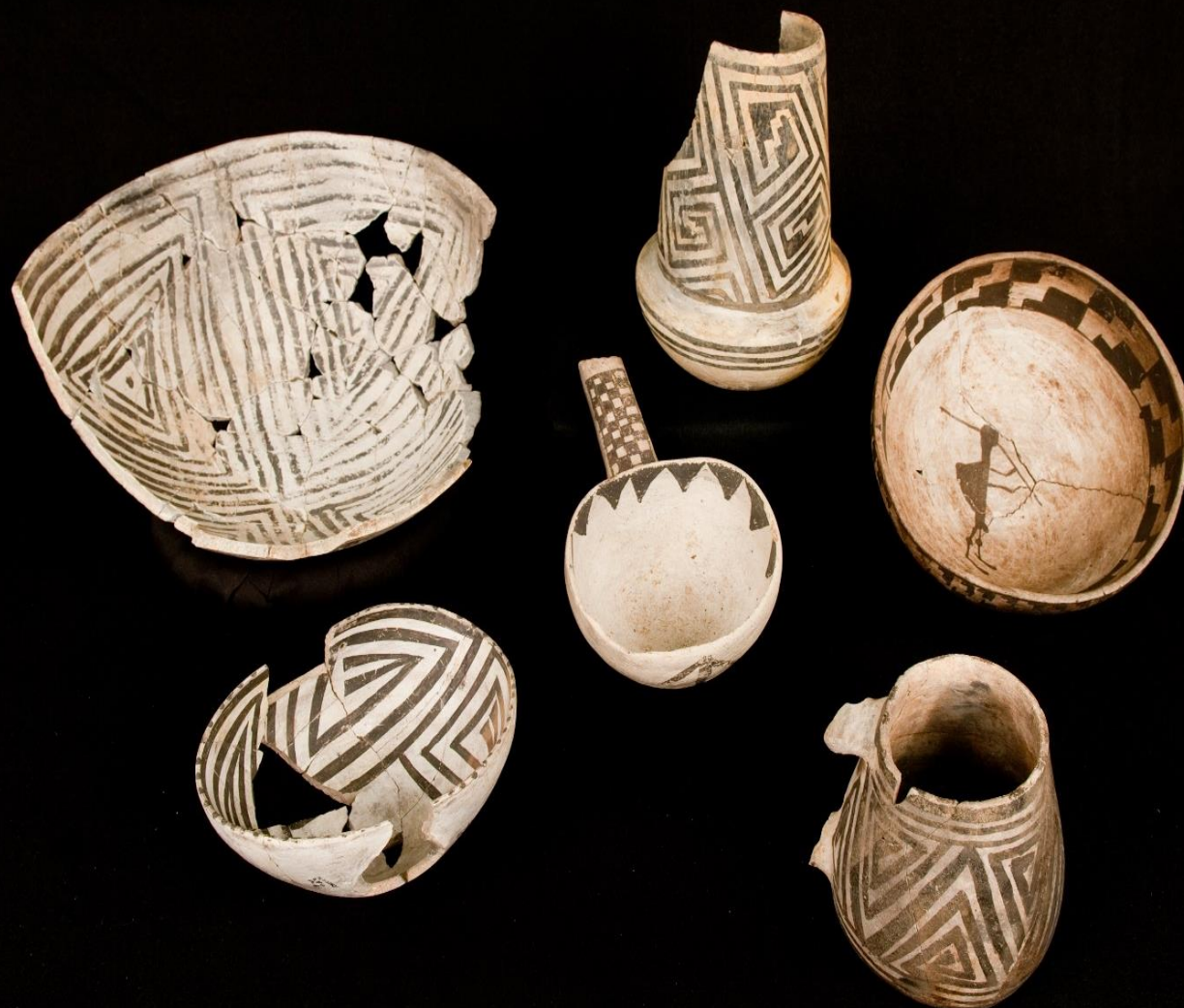
McElmo Black-on-white (AD 1075-1225) ceramic vessels in CANM collections.