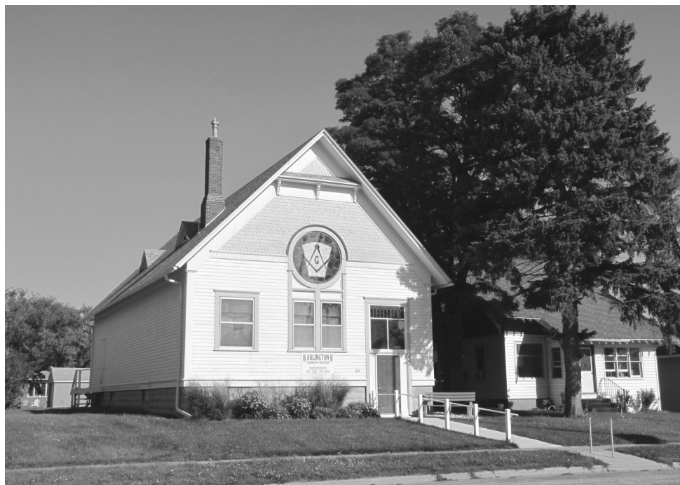
The State Historic Preservation Office worked with the National Park Service to add the Masonic Temple in Arlington to the National Register of Historic Places in 2017.