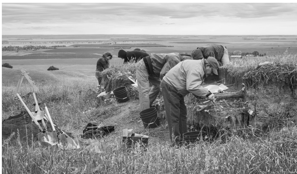
Staff and students excavate a bison kill site near Ree Heights.