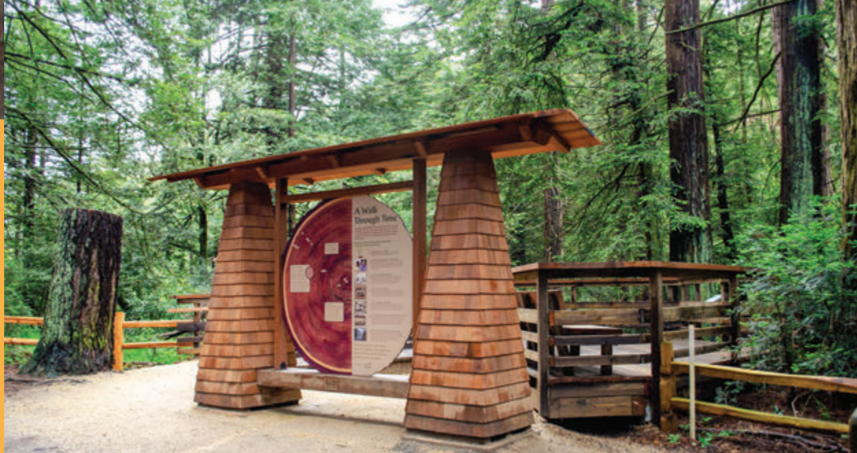
Old Growth Redwood Heritage Viewing Deck and Interpretive Exhibit

Visitors are responsible for knowing and complying with park rules (Ordinance 38). See ebparks.org/rules .