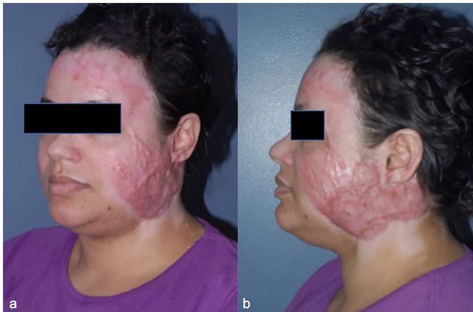
Figure 4. Case 4, a 36-year-old female sustained deep partial burns to her head and neck from a house fire. Oblique view (a) and lateral view (b) before treatment