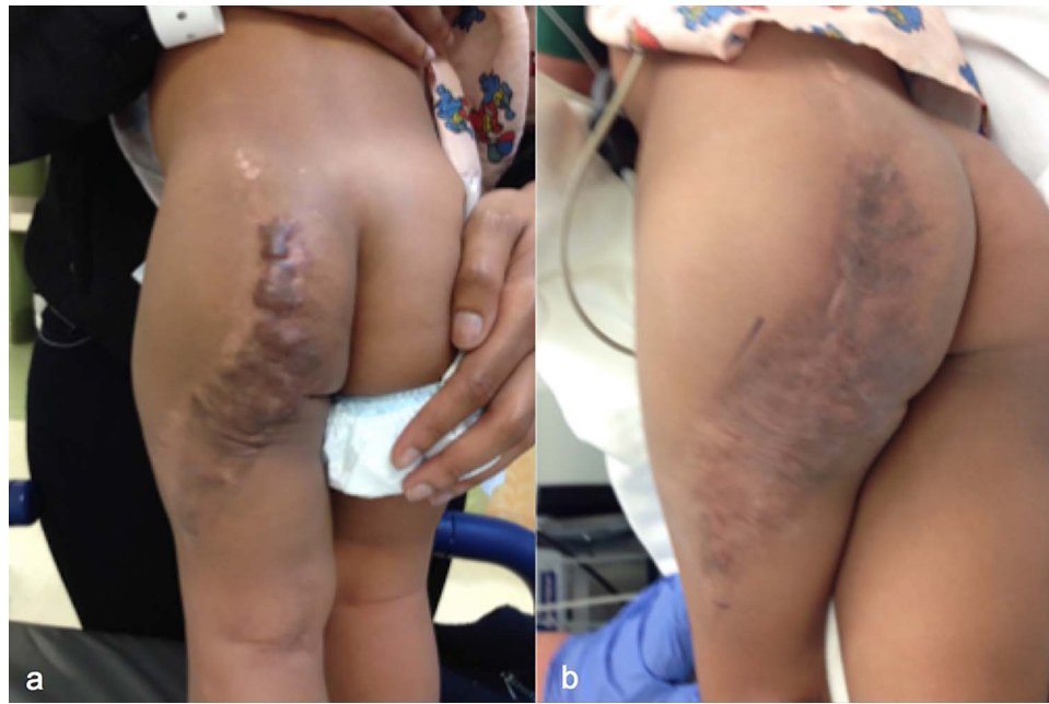
Figure 1. Case 1, a 4-year-old boy sustained superficial partial thickness scald burns to his right buttock and thigh, before treatment (a), and after treatment (b)

and titrated to a maximum energy of 90 mJ and 1% density. The beams cover a square size of 10 mm × 10 mm or 1 cm 2 . The pattern should appear as a contiguous square grid with no overlap, unlike PDL. If the skin is charred, the char should be left in place, not removed. After fCO 2 AFR, we apply topical triamcinolone over the treated areas as a method of laser-assisted drug delivery, to a maximum dose of 80 mg, or 1 mg/kg. Full-field CO 2 is absolutely contraindicated in the treatment of burn scars because it results in a secondary burn injury that cannot re-epithelialize, except from the periphery.