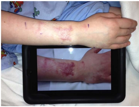
Figure 2. Case 2, an 8-year-old boy sustained deep partial thickness contact burns to his right forearm

following laser treatment, lasting 1–2 days. Pruritus can last from days to weeks. Infection is uncommon, reported in < 1% of cases [10,37]. Preoperative antibiotics should be avoided unless the patient has a specific indication. Patients with a history of frequent perioral herpes infections should receive antiviral prophylaxis for head and neck laser procedures. In patients with higher Fitzpatrick skin types or more skin pigmentation, transient postinflammatory hyperpigmentation can occur from greater responses in melanin and fibroblasts [6,51,52]. Decreasing the fluence for higher Fitzpatrick skin types helps to minimize damage with PDL. Normal activity may begin following treatment. Patients should be educated to avoid exposing the area to high-intensity light early during the postoperative period. Sun protection with sun-blocking agents and compression garments can be applied after 2–3 days once the epithelial layer is restored [6]. Sunscreen should be continued indefinitely, to prevent long-term ultraviolet (UV) damage and permanent hyperpigmentation changes.